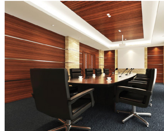
Alcove ramp cove