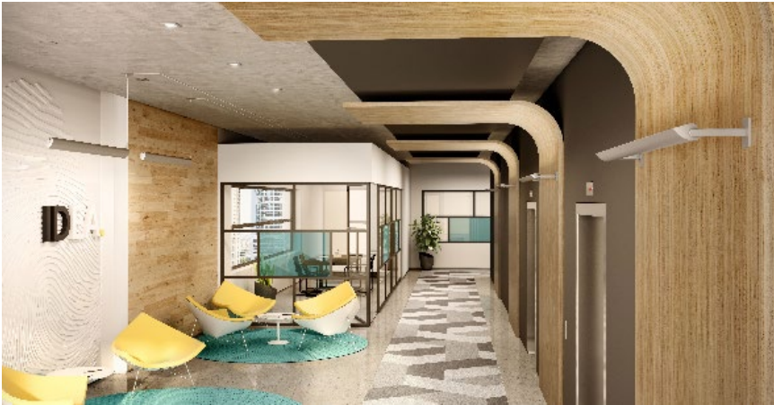
Axle pendant and wall