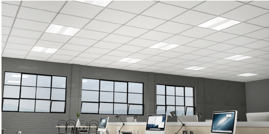
Nova 2x2 recessed grid