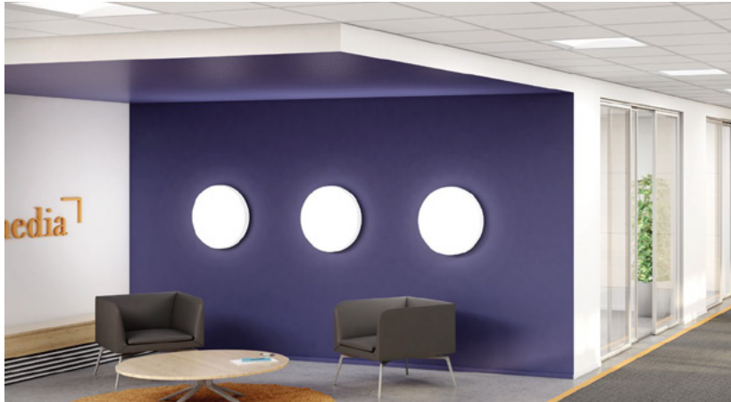
POP Core wall