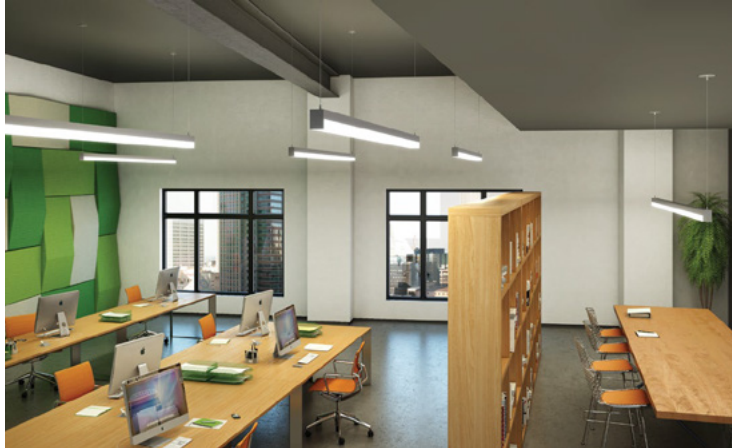
Quad pendant cable