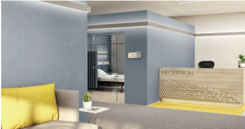
Walo wall direct/indirect