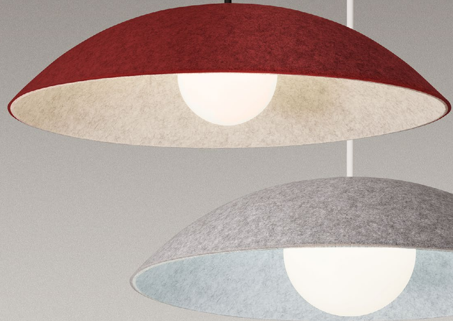
Arq Globe Acoustix Above: Felt Combination: Cherry and Sand Globe Diameter: 6"