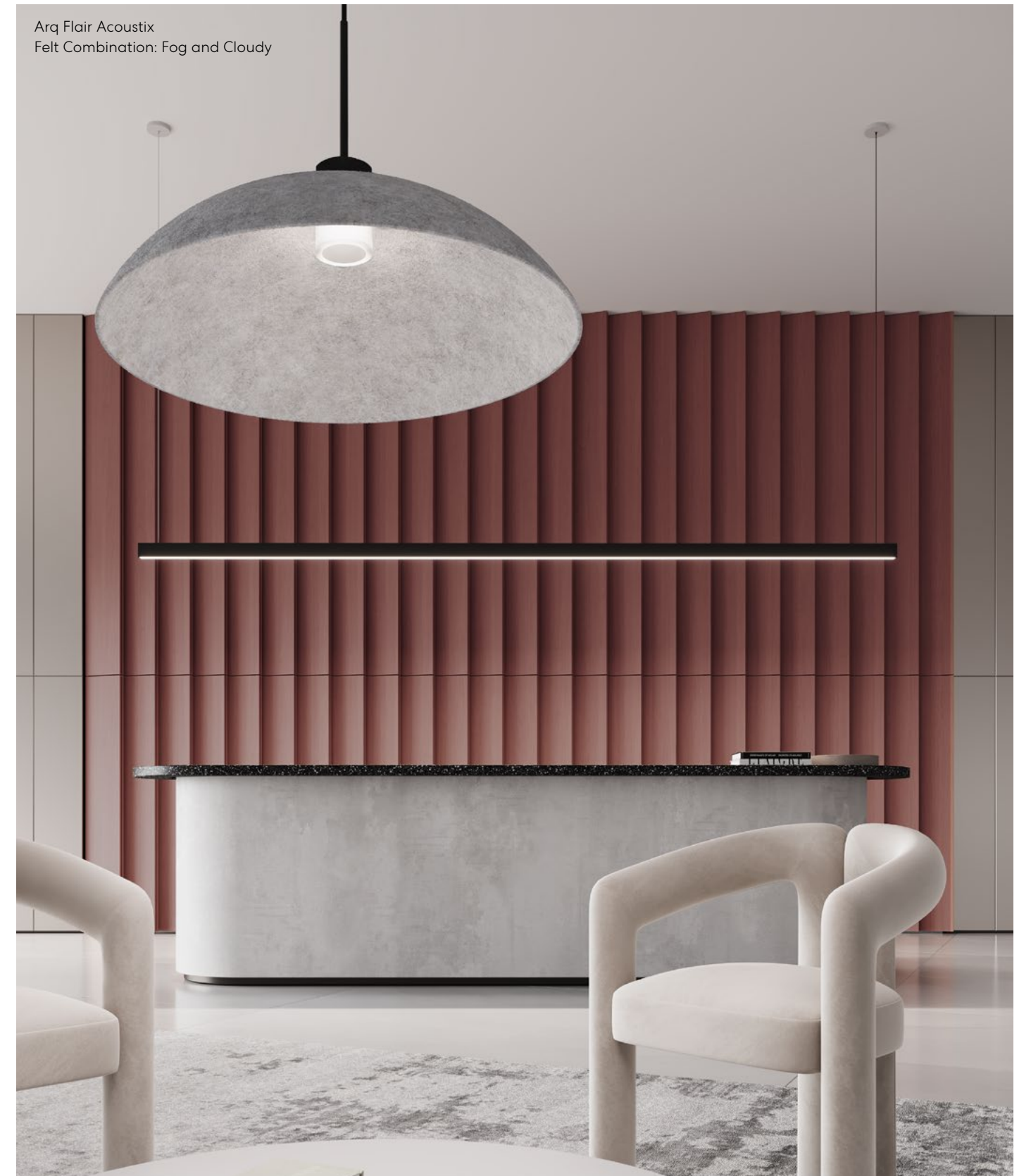
Arq Flair Acoustix Felt Combination: Fog and Cloudy