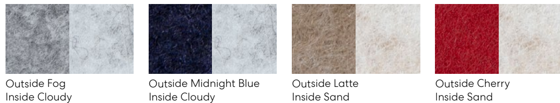
Outside Fog Inside Cloudy