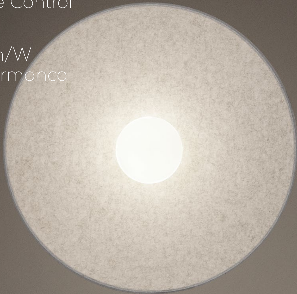
Arq Globe Acoustix Felt Combination: Latte and Sand Globe Diameter: 6"