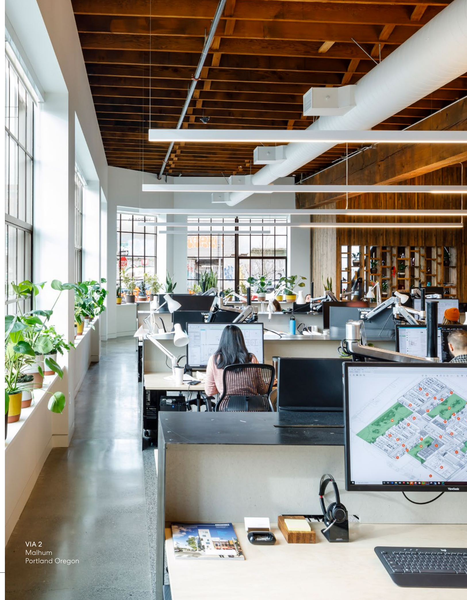
VIA 2 Malhum Portland Oregon