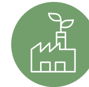
Manufacturing & Clean Energy