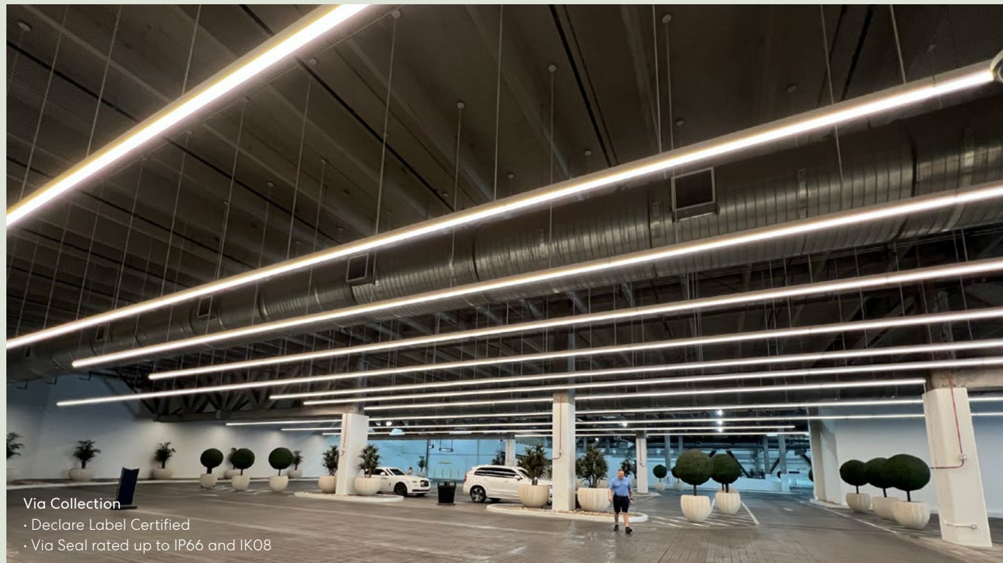
Via Collection • Declare Label Certified • Via Seal rated up to IP66 and IK08