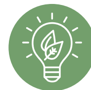
Product Design & Innovations

By integrating sustainability into every aspect of our business, we strive to create a brighter future for generations to come .