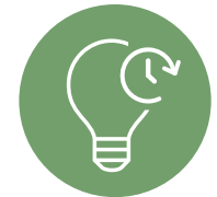
Product Maintenance & End-Of-Life