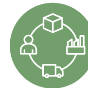
Supply Chain & Product Composition