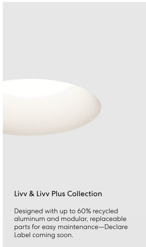
Livv & Livv Plus Collection

We lead in light quality, glare control, and integration with advanced controls, ensuring our innovations are both human-centric and resource-conscious.