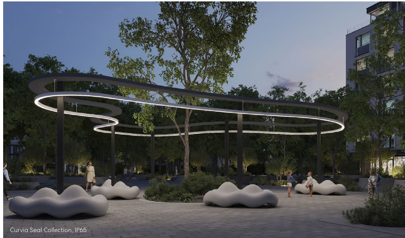
Curvia Seal Collection, IP65