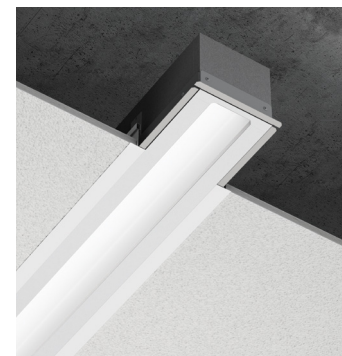
CAVA RECESSED GRID