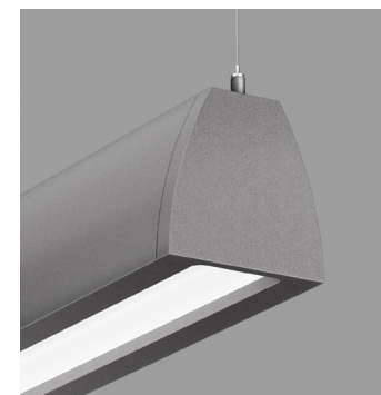
CAVA CURVE PENDANT CLOSED