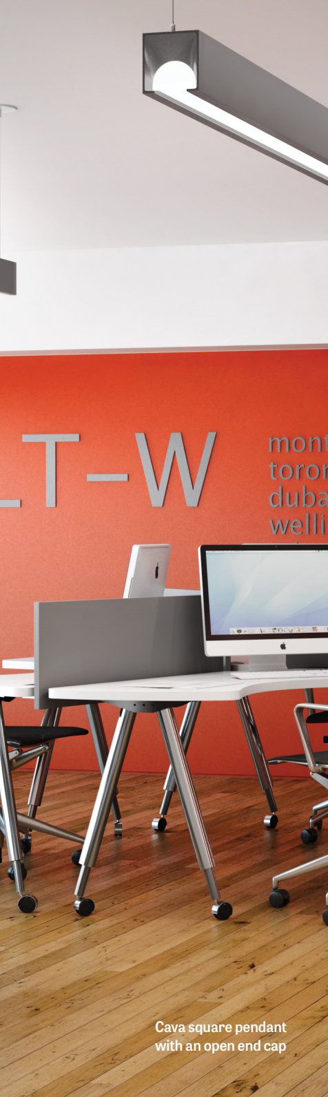
Cava square pendant with an open end cap