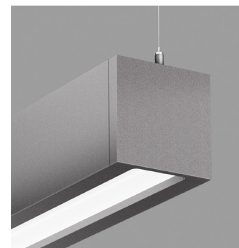
CAVA SQUARE PENDANT CLOSED