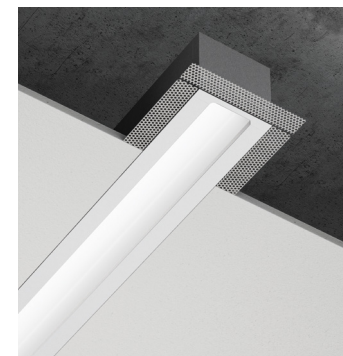
CAVA RECESSED DRYWALL